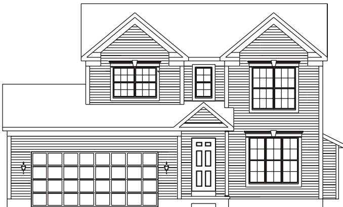
Version 3 1494 Square Feet